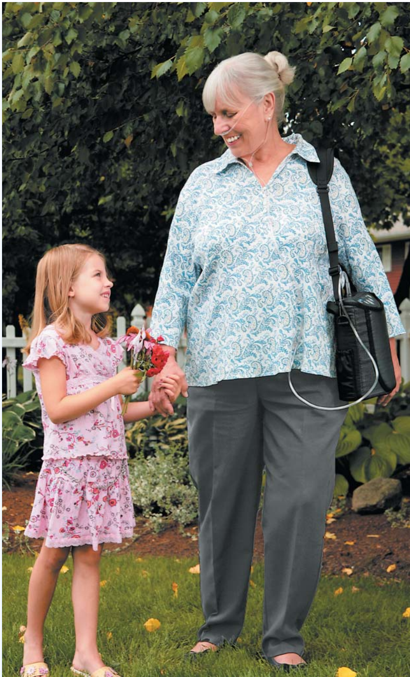
Invacare® XPO 2 ™ Portable Oxygen Concentrator

The new Invacare® XPO 2 ™ portable concentrator is the latest addition to Invacare's proven line of home oxygen technologies. Now providers and patients have a choice of ambulatory systems from Invacare, the world leader in oxygen. Named for its extreme portability, the XPO 2 is designed to be lightweight, clinically robust, and easy to operate. The supplemental battery and AC/DC power options make it easy for patients to go just about anywhere without the fear of running out of oxygen.